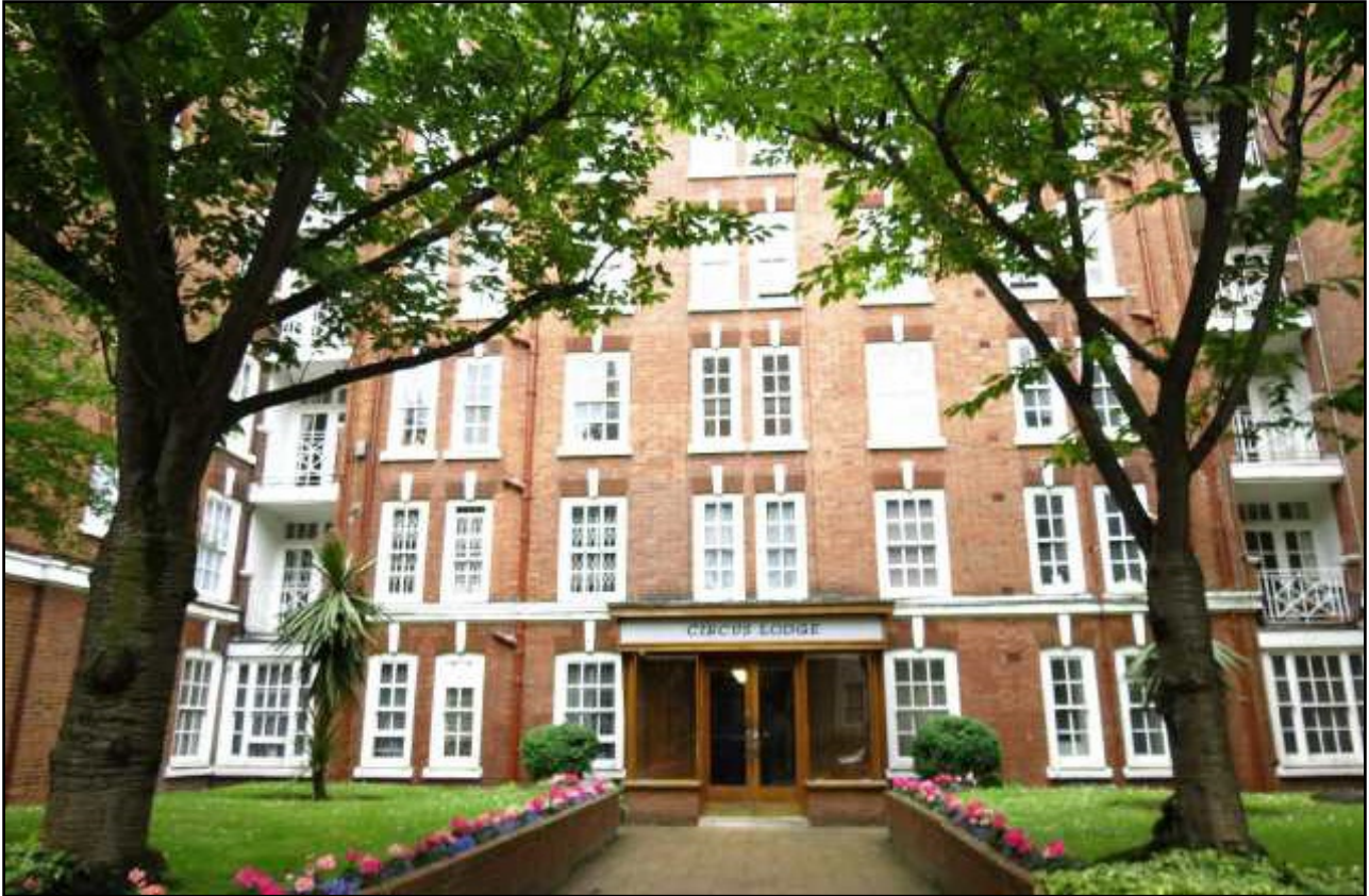
Circus Lodge, Circus Road, St John's Wood, NW8