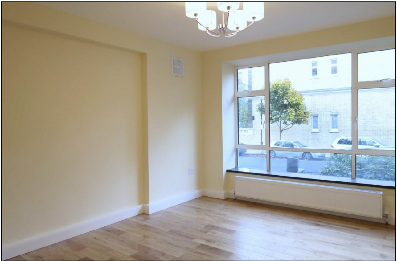
Lexham House, Lexham Gardens, South Kensington, W8