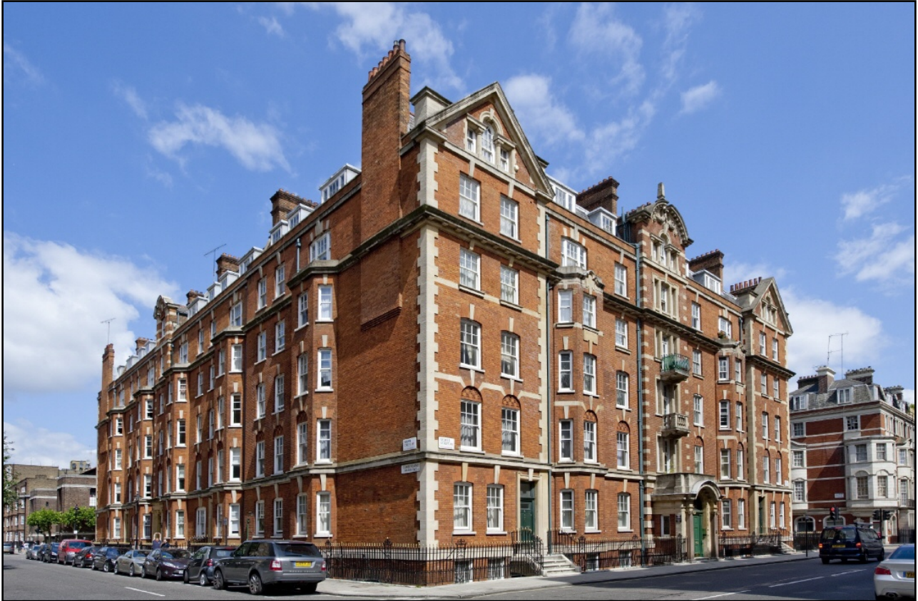
Cumberland Mansions, Brown Street, Marylebone, W1H