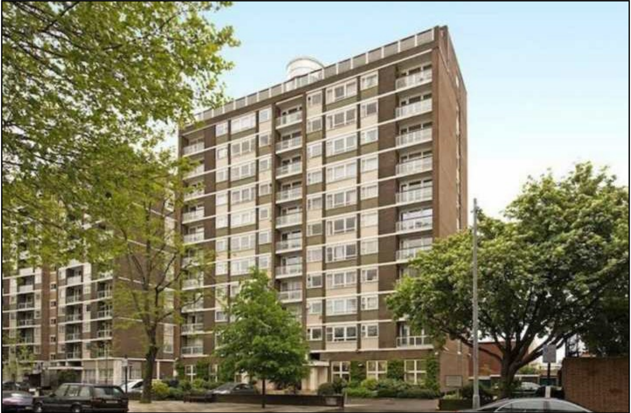
Lords View II, St John's Wood Road, St John's Wood, NW8