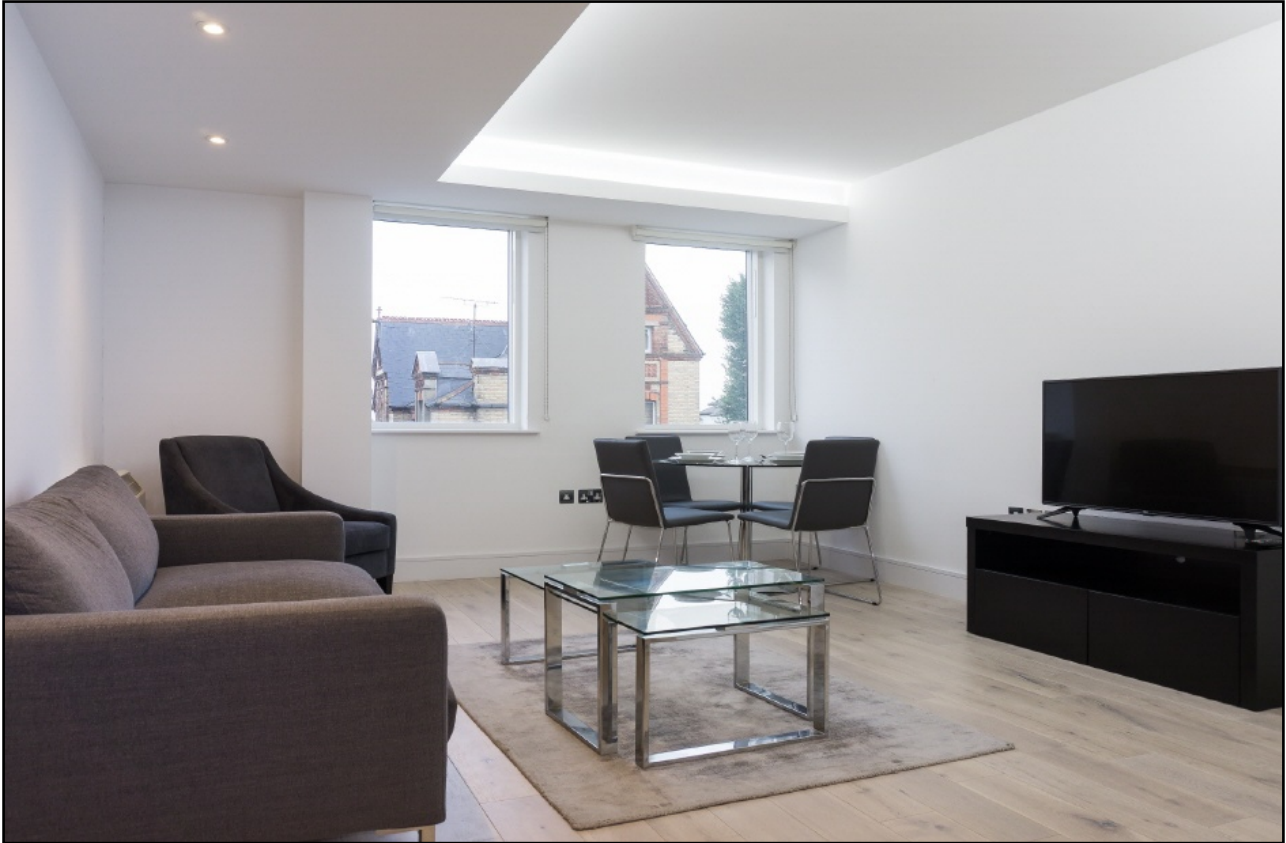
Ostro House, Hampstead, NW2