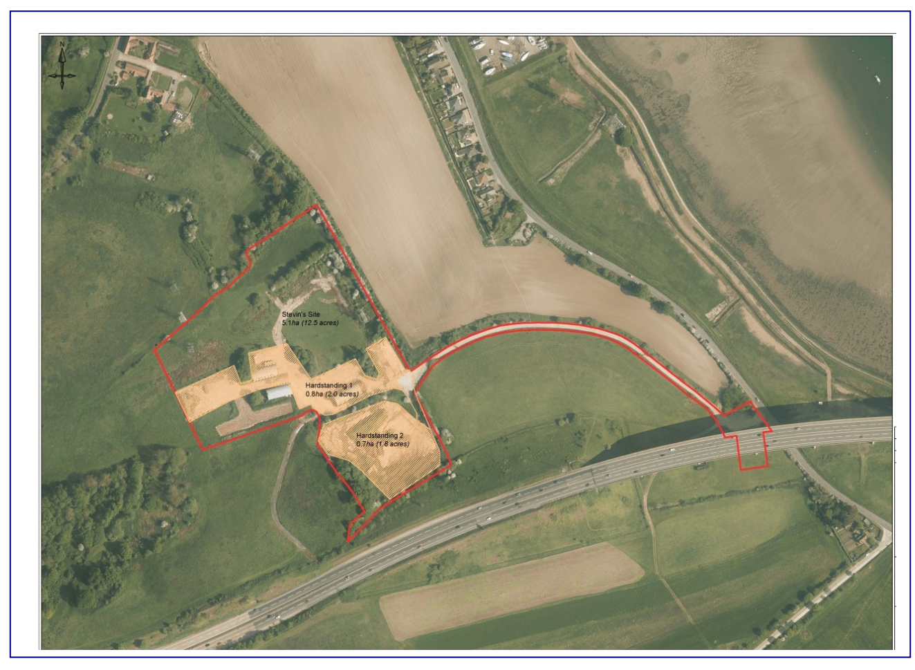
Stevins, The Strand, Wherstead, Ipswich IP2 8NL