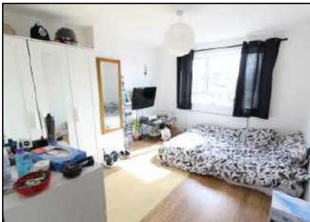
Bedroom Two 10'5 x 9'7 (3.18m x 2.92m) Double glazed window to rear, radiator, power points, tv point