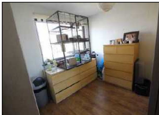
Bathroom Double glazed frosted window to side, radiator, low level w/c, wash hand basin, bath with

shower over, tiled walls, laminate flooring, coving to ceiling