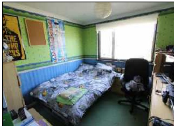
Bedroom Four 9'6 x 10'3 (2.90m x 3.12m) Built in wardrobe, radiator, double glazed window to front, power points, laminate flooring