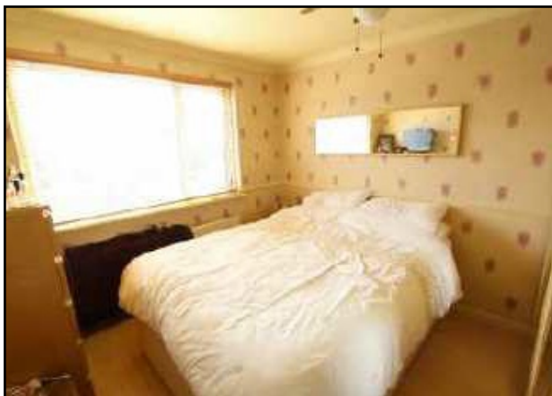
Bedroom Three 9'7 x 9'6 (2.92m x 2.90m) Coving to ceiling, double glazed window to front, tv point, power points, radiator