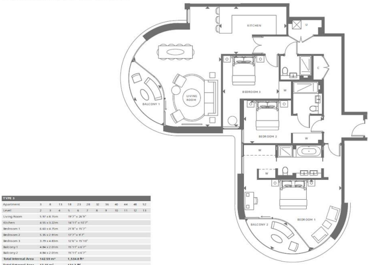
THREE BEDROOM APARTMENT