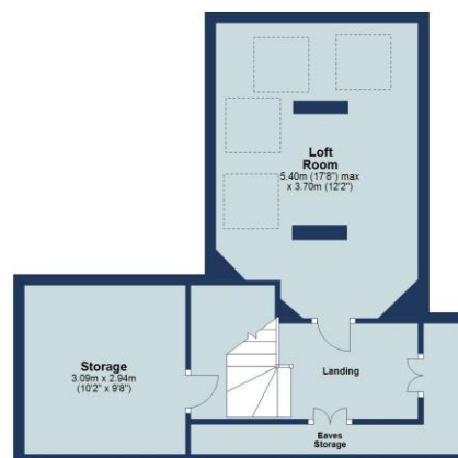
Second Floor Approx. 37.2 sq. metres (400.8 sq. feet)

Looking to Sell or Let your current home?