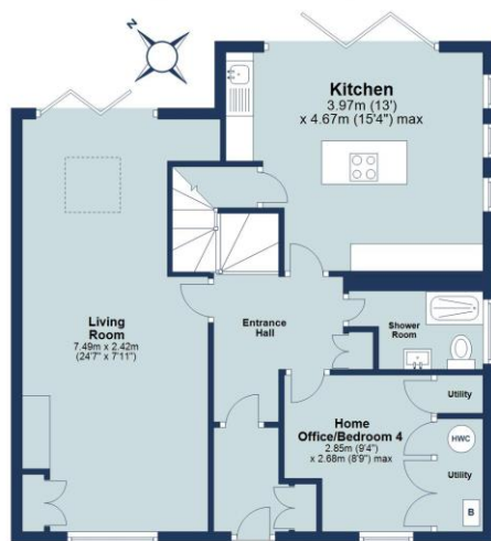
Ground Floor Approx. 68.4 sq. metres (736.3 sq. feet)