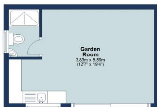
Garden Room Approx. 22.6 sq. metres (242.9 sq. feet)