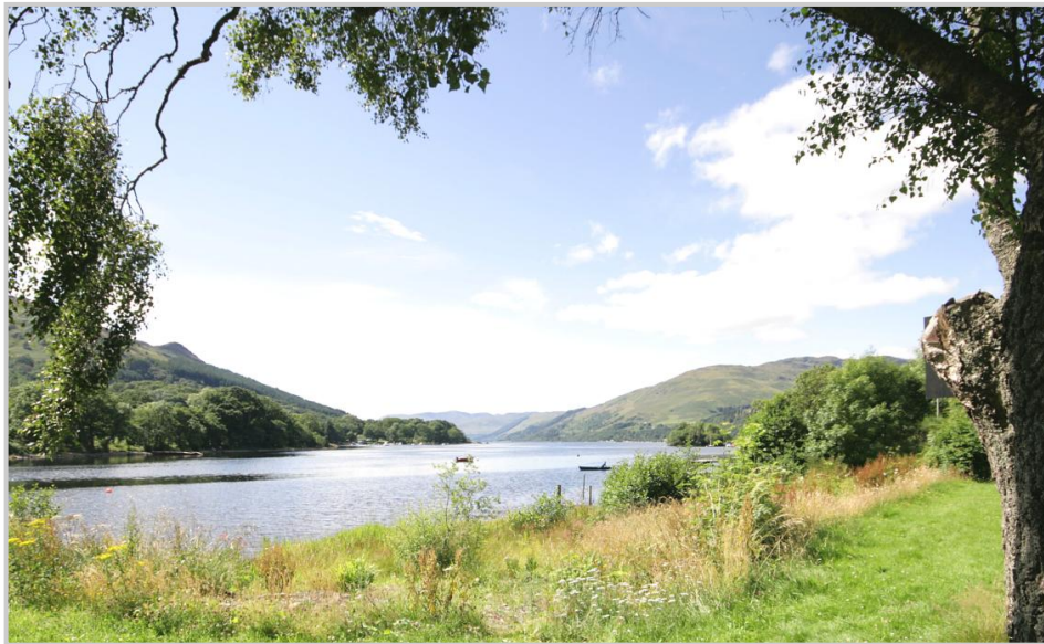
The view over Loch Earn, approx a 3min walk from the site.

Further detail relating to the planning permission can be obtained via the Loch Lomond & Trossachs planning website using the link below: