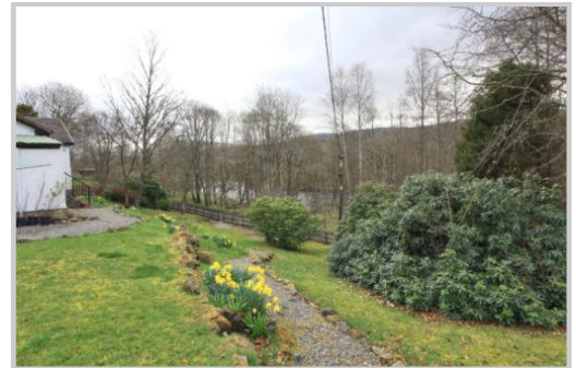
Craigdochart, Craignavie Road, Killin, FK21 8SH