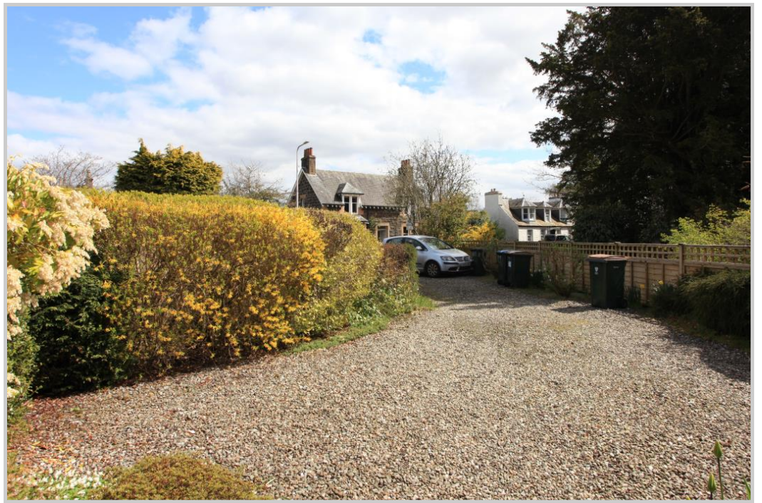
Schiehallion, Dalginross, Comrie, PH6 2ED