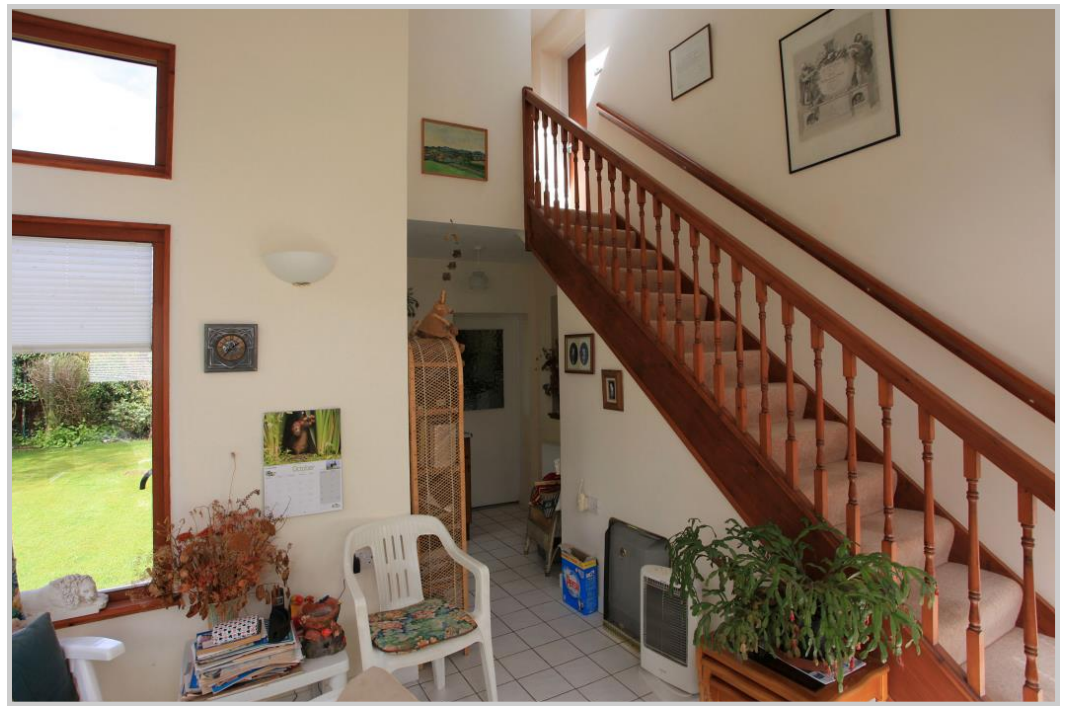
Schiehallion, Dalginross, Comrie, PH6 2ED