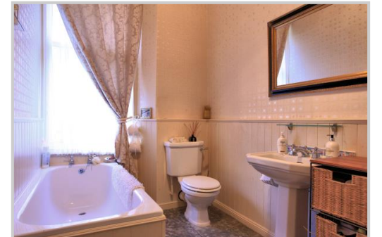
Newstead, Ancaster Road, Crieff, PH7 4AL