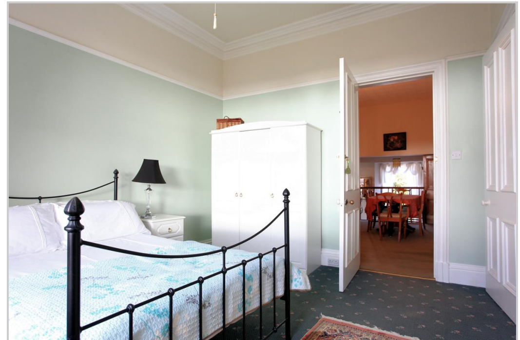
Newstead, Ancaster Road, Crieff, PH7 4AL