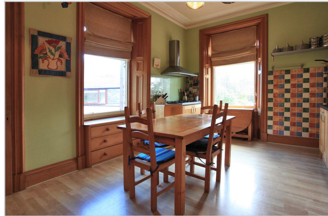
Newstead, Ancaster Road, Crieff, PH7 4AL