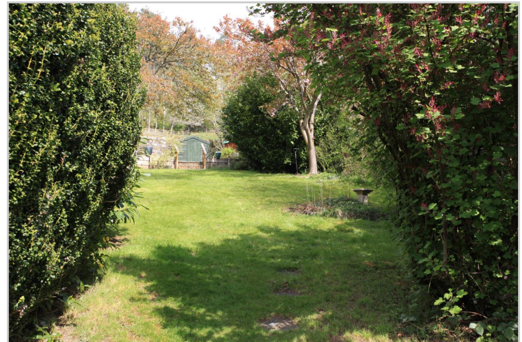
Newstead, Ancaster Road, Crieff, PH7 4AL