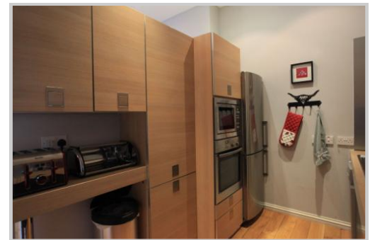
Flat A, 35 James Square, Crieff PH7 3EY