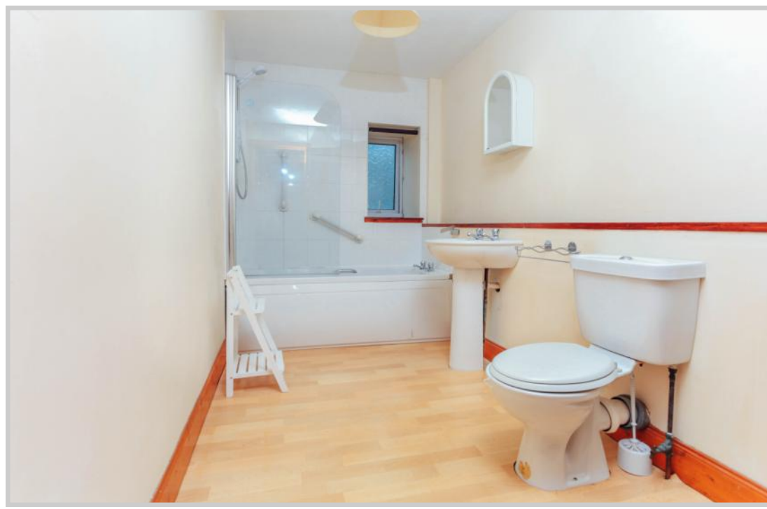
Flat 2, Strathearn Towers, James Square, Crieff PH7 3EY