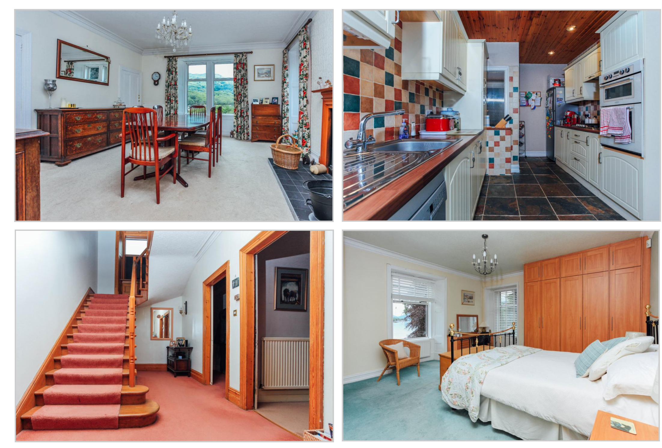
Rath Erenn, St Fillans, Perthshire, PH6 2NF