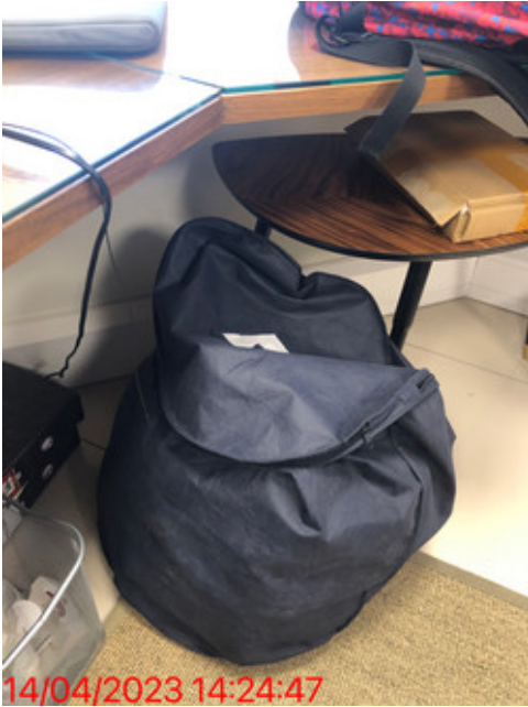
Bag left by front door