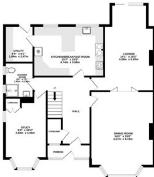
GROUND FLOOR 1020 sq.ft. (94.6 sq.m.) approx.