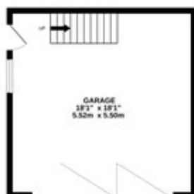
GARAGE GROUND FLOOR 327 sq.ft. (30.4 sq.m.) approx.